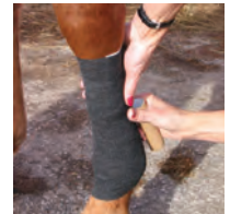
Seal end of bandage to bottom layer with fingernail for a strong, solid seal.