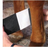
After cleaning the wound, unroll to expose absorbent foam pad.