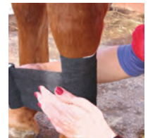
Prior to each wrap around leg, pull bandage out approx. 6".