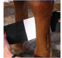
Place foam pad over wound.