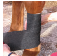
Continue to wrap at desired tension with 50% overlap.