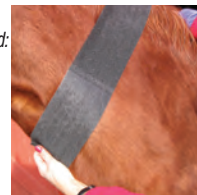
Once the wound has been cleaned, unroll to expose the absorbent foam pad. Place the pad over the wound.